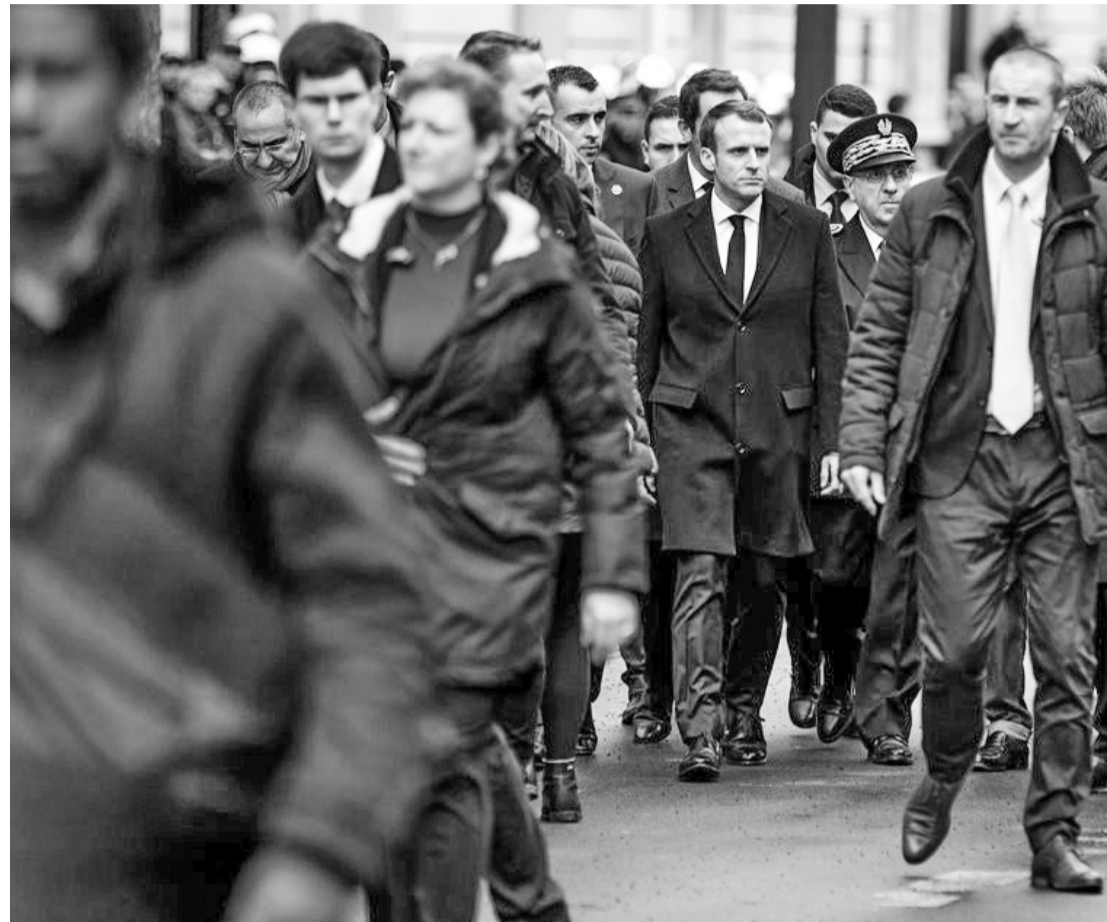
President Emmanuel Macron, center, inspecting the damage from protests over a planned fuel tax increase in Paris this month