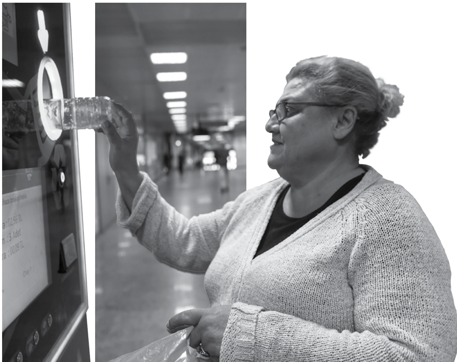
A woman puts a plastic bottle into a vending machine as she waits to take extra credit on her Istanbul card at Istanbul metro station

Every bottle or can placed in the machine gives extra credit on Istanbul card -- the universal ticket for using public transport in the city -- in a pilot project by the municipality to promote recycling.