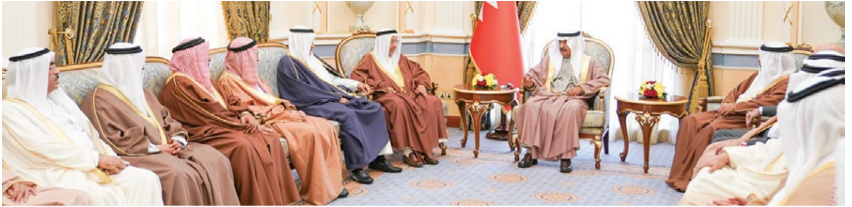
HRH the Premier receives Royal Family members and senior government officials.

HRH Premier affirmed that caring for the citizens in the health, educational, housing, social and service fields, and ensuring them the requirements of