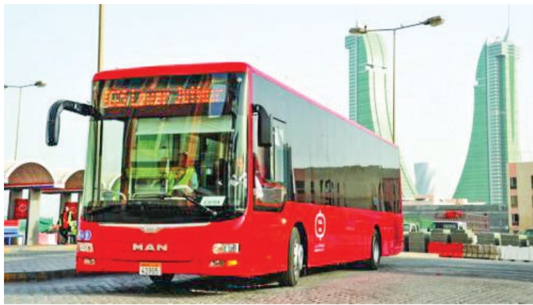
The Bahrain Transport Company runs services across 32 routes, say sources.

The sources also added that many a time the buses are stop-