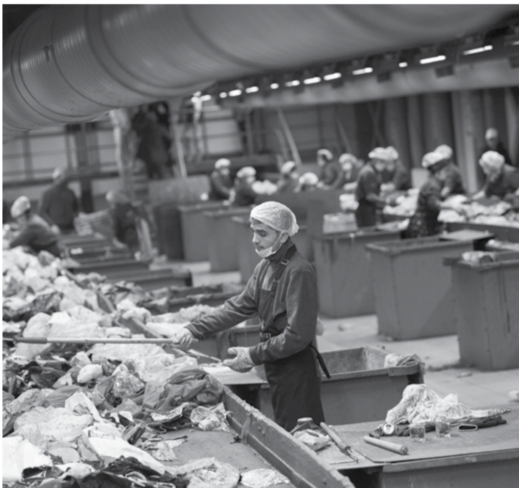
Turkish workers eliminate garbage in the recycling centre in Istanbul. The country of over 80 million people has notoriously bad record on recycling and waste. Activists say this needs to change fast and there are signs, albeit tentative, the authorities are starting to understand the need to change the public's profligate habits.