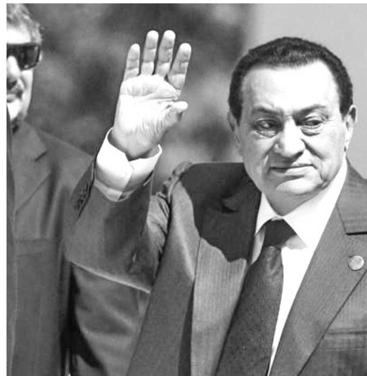
Hosni Mubarak regime controlled press in Egypt with very limited freedom for journa

In all my years of writing, it had always been clear what could and what couldn't be addressed, even when the difference between those things shifted as the political story changed. There