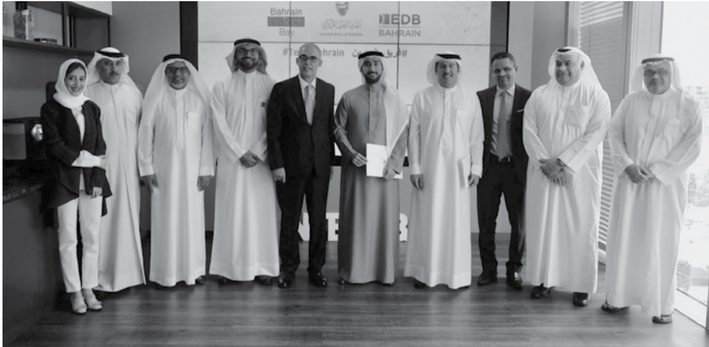
During a photocall on the occasion of a ceremony held to announce the successful exit of Tarabut Gateway from CBB's sandbox