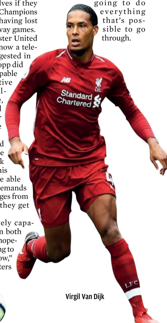
Virgil Van Dijk

"But the main thing for us is that we want to stay at the highest level and we're going to do everything that's possible to go through."