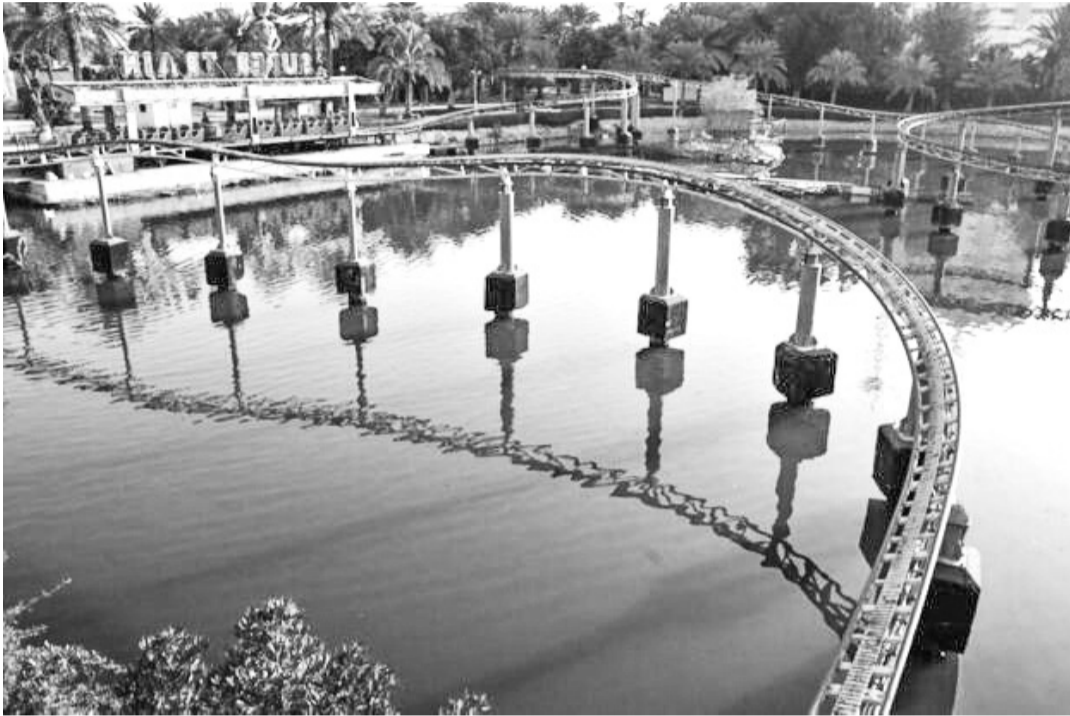
The water park project is implemented by the Works Ministry in co-operation with the Capital Governorate.

"The water park is the lung with which Manama breathes,