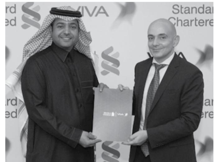
The deal signing