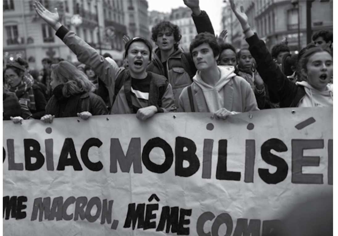
Students hold banners reading "Tolbiac in action, Macron, same fight!"

Embattled French President Emmanuel Macron Monday announced a series of financial measures seeking to defuse the "yellow vest" revolt that has triggered violent protests in cities across the country.