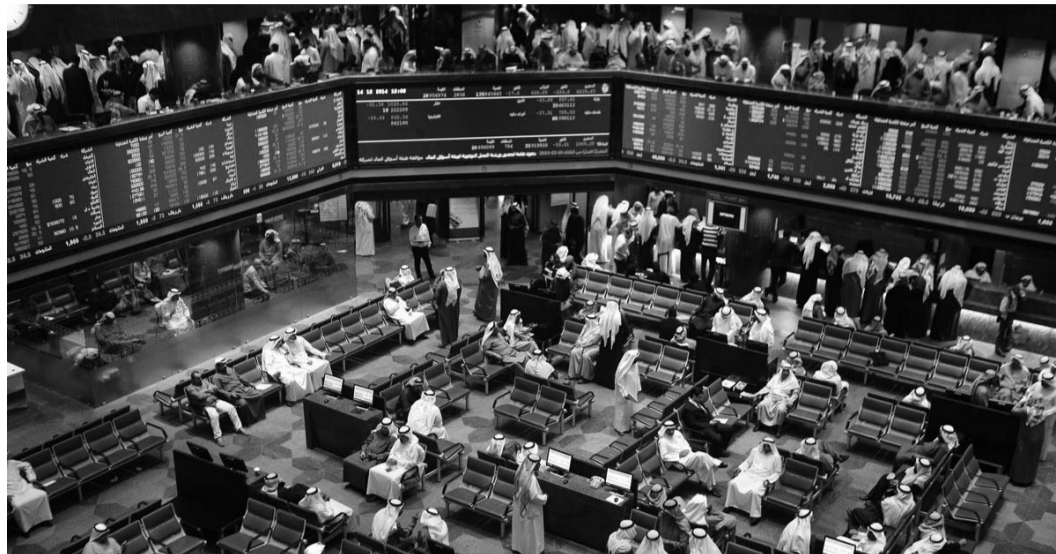
Traders on the floor of Saudi Stock exchange

El Sewedy Electric added 5.6pc; its unit had signed a contract to develop land