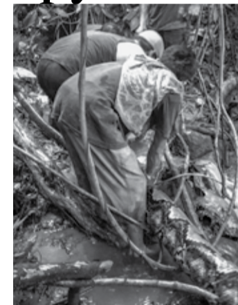
A sequence of pictures taken from a video grab showing villagers trying to capture a large python in Padang Pariaman, in West Sumatra