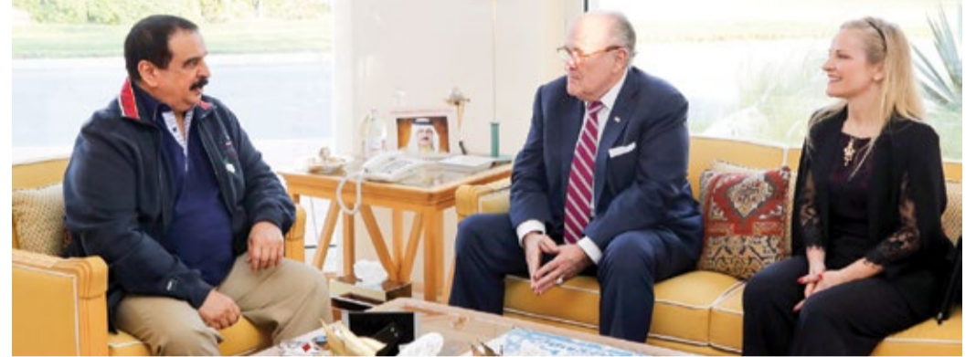
His Majesty King Hamad bin Isa Al Khalifa yesterday received former New York mayor and adviser to US President Donald Trump, Rudy Giuliani and the accompanying delegation at the Safriya Palace. HM the King praised the longstanding Bahraini-US relations, noting keenness of the two countries to constantly develop them. Topics of joint interests were also discussed.