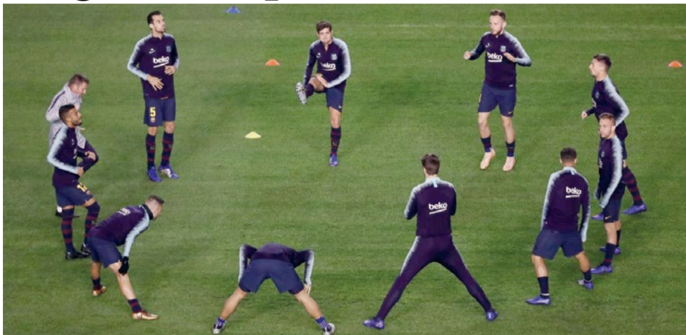
Barcelona players during the warm up before a match