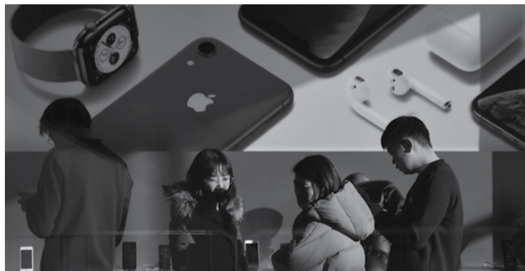
Customers (C) look at products in an Apple store in Beijing

The China case is based on patents which enable consumers to adjust and reformat the size and appearance of photographs,