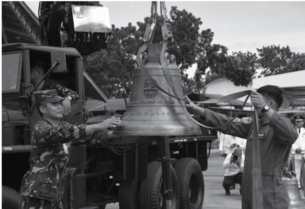
Philippine military personnel unload one of the three Balangiga church bells after it arrived from the US at a military airbase in Manila

"Returning these bells is the right thing to do," US Ambassador Sung Kim said at a sober handover ceremony on a Manila airfield, where a cheer went up