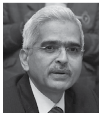
Shaktikanta Das (file)

cheer markets as investors expect communication between