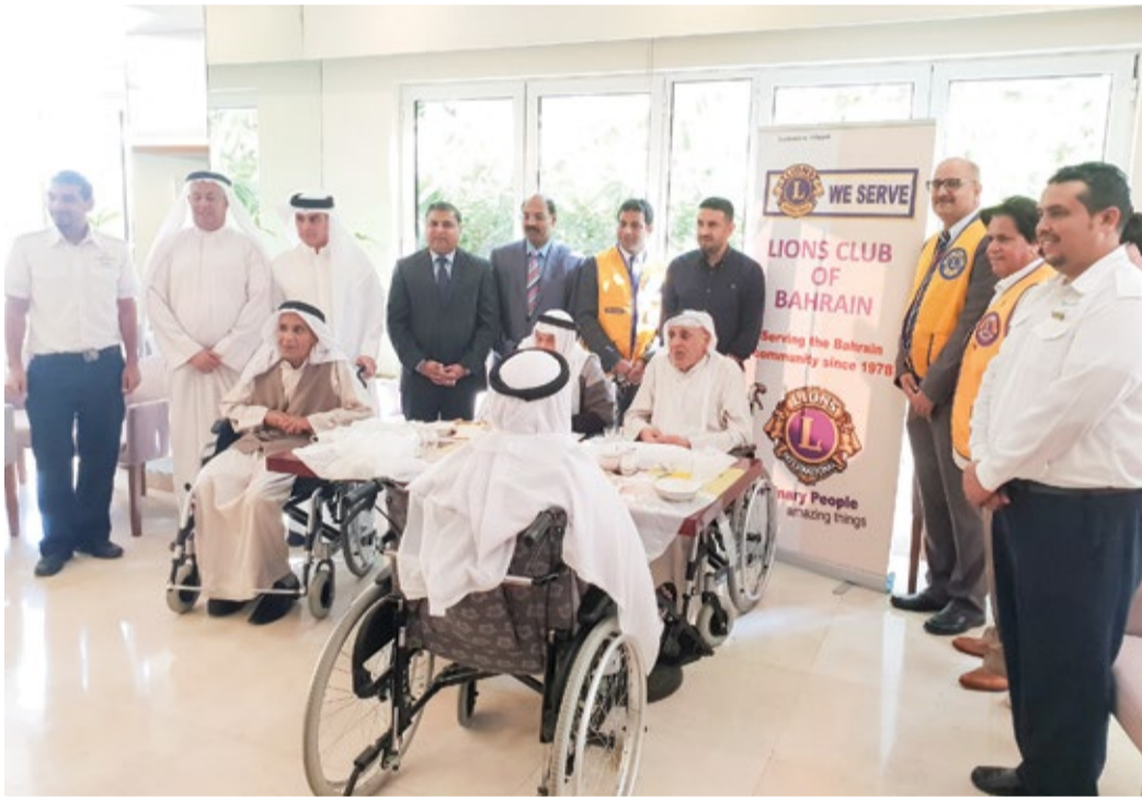
Lions Club of Bahrain hosted lunch for members of the old age home in Muharraq at Somerset Al Fateh Hotel. It was part of the society outreach programme being undertaken by the Lions Club of Bahrain. The members of the old age home had a great outing with the Lions and other members at the Somerset Hotel.

The Prime Minister called for expanding investments in the national industries in light of the government's support and facilities for investors.