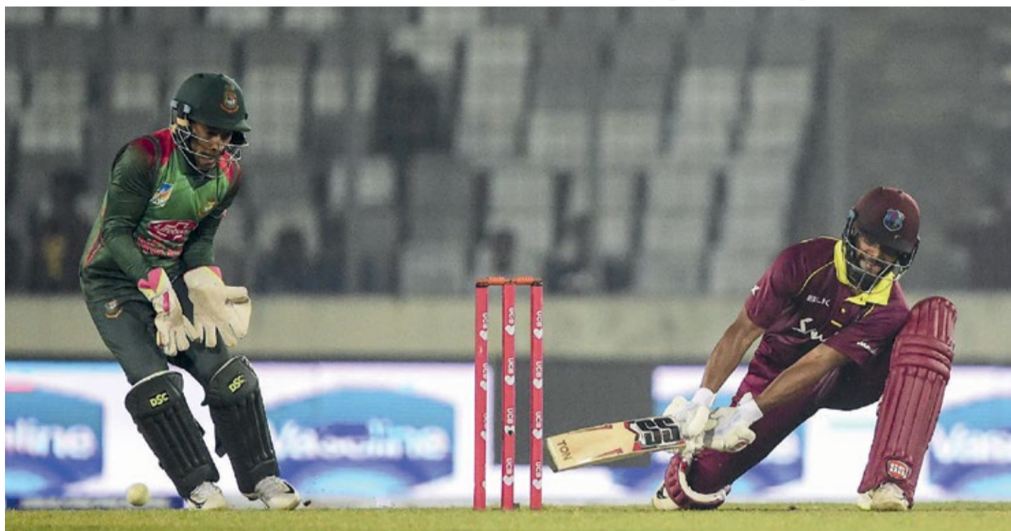
West Indies cricketer Shai Hope (R) plays a shot as Bangladesh cricketer Mushfiqur Rahim (L) looks on

Hope shared 71-run in an unbroken seventh wicket stand