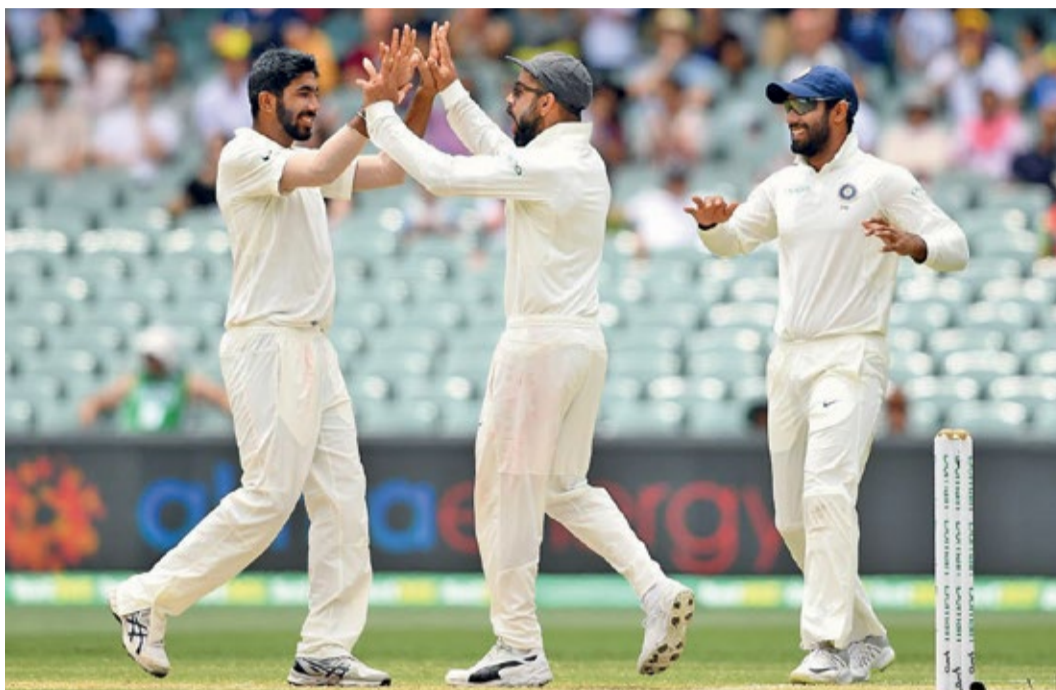
India's Jasprit Bumrah (L) celebrates with captain Virat Kohli after dismissing Australia's captain Tim Paine on day five of the first test match between Australia and India at the Adelaide Oval

Compared to his counterpart Paine, weighed down by a sore index finger and a long list of concerns, Kohli heads to Perth