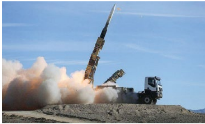
A Sayad missile being fired from the Talash missile system during an air defence drill at an undisclosed location in Iran.

Iran confirmed yesterday that it had carried out a recent missile test after Western powers sharply criticised a December 1 launch of medium-range ballistic missiles. "We are continuing our missile tests and this recent one was a significant test," the Fars news agency reported, citing