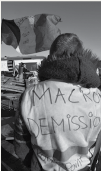
A man wearing a yellow vest with the inscription "Macron resignation" stands in front of a road blockade

Macron's government had previously suggested that any increase in the minimum wage would destroy jobs rather than