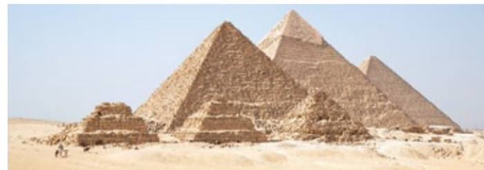
The pyramids in Giza is a Unesco heritage site.