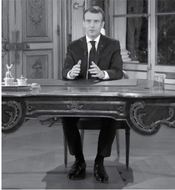
French President Emmanuel Macron speaks during a special address to the nation