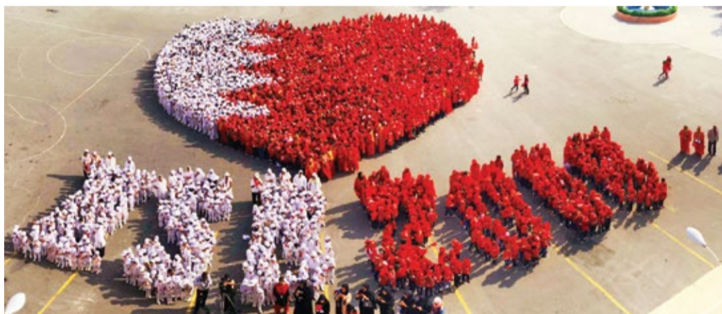
The kindergarteners and primary school students of the Indian School, Bahrain (ISB) paid rich tribute to the Kingdom on the occasion of the National Day celebrations at its Riffa campus on Tuesday. A human emblem formation for the third year in succession was the highlight of the day. Around 5,000 students and staff joined in to form the human Heart Flag of Bahrain reflecting their ever-glowing love towards the Kingdom.